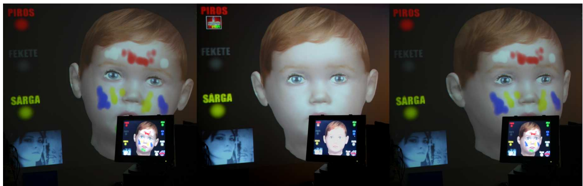
Fig 3: The virtual child appearing on the touch screen monitor (lower right) and projected in large scale (background). The face recognition camera input image shows the user in the lower left corner allowing the virtual baby to maintain eye contact and look at visitors.