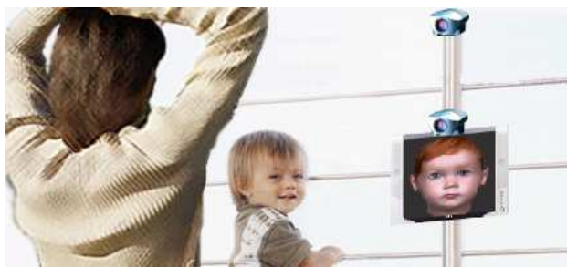
Fig 1: “ Face Painting ” interactive art installation (original concept drawing) using a virtual digital baby and computer vision techniques to sense the presence of the audience.

As the children reached the virtual baby’s face, it noticed being touched and reacted accordingly with a repertoire of negative and positive facial expressions. It was also designed to allow the user painting with his or her finger by changing the colors and properties of the underlying skin.